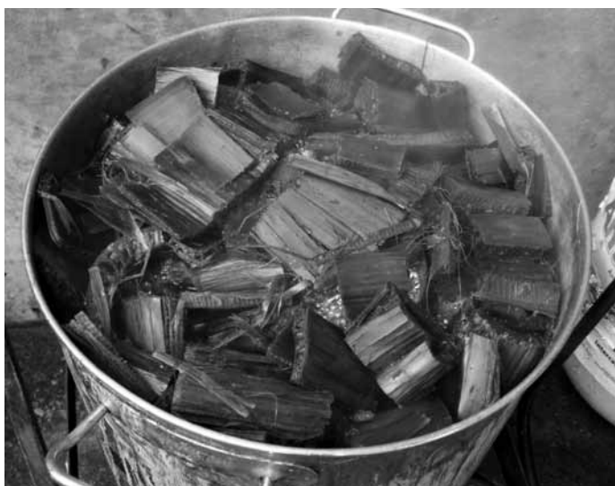
Banana stalk fiber cooking in soda ash solution on a propane burner.